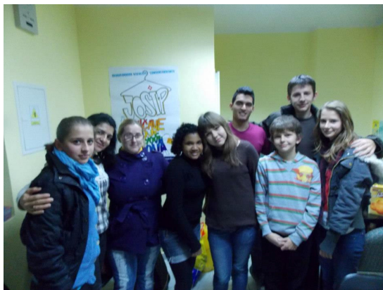
Youth fellowship every second Saturday (picture left)