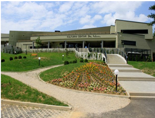
Cultural centre in Novi Marof (picture left)

"Now all things are of God, who has reconciled us to Himself through Jesus Christ, and has given us the ministry of reconciliation... Now then, we are ambassadors for Christ, as though God were pleading through us: we implore you on Christ's behalf, be reconciled to God" 2 Corinthians 5:18,20